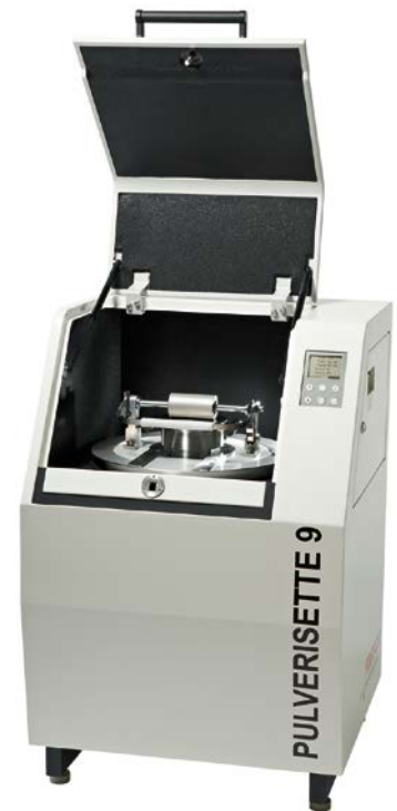
Vibrating Cup Mill PULVERISETTE 9

Accessories: We recommend hardened steel or chromium-free tool steel grinding sets for most applications. For extremely hard samples grinding sets made of hardmetal tungsten carbide should be used. For glass and ceramics are grinding sets made of zirconium oxide suitable and for soil samples agate grinding sets.