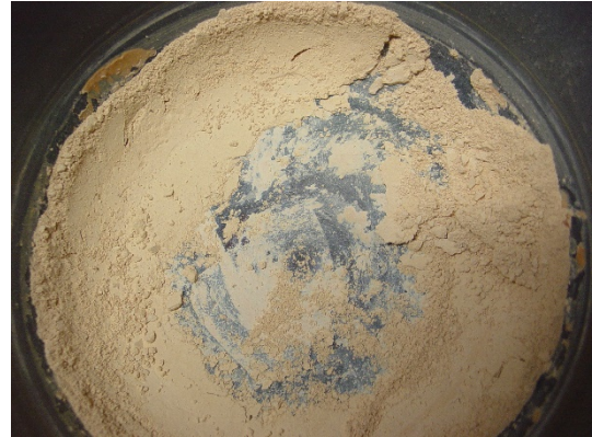
Fig. 3: The result an uniform system

Author: Dipl. Chem. Wieland Hopfe, Fritsch GmbH, E-Mail: info@fritsch.de