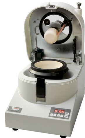
Fig. 1: Mortar Grinder PULVERISETTE 2

From the area of mixtures liquid – solid is the production of filled pastes to be mentioned. Especially challenging here is to add as much as possible solids in the high viscosity organic phase. An additional example for this is, when one has to add to organic binder (for example synthetic resin or varnish or in the simplest case oil) fine metallic, ceramic or inorganic powders. High viscosity pastes evolve which can be compared which shoe polish in a tube. Experts often talk about filled composite materials. Often the increase of the degree of the solid content is the goal of all activities.